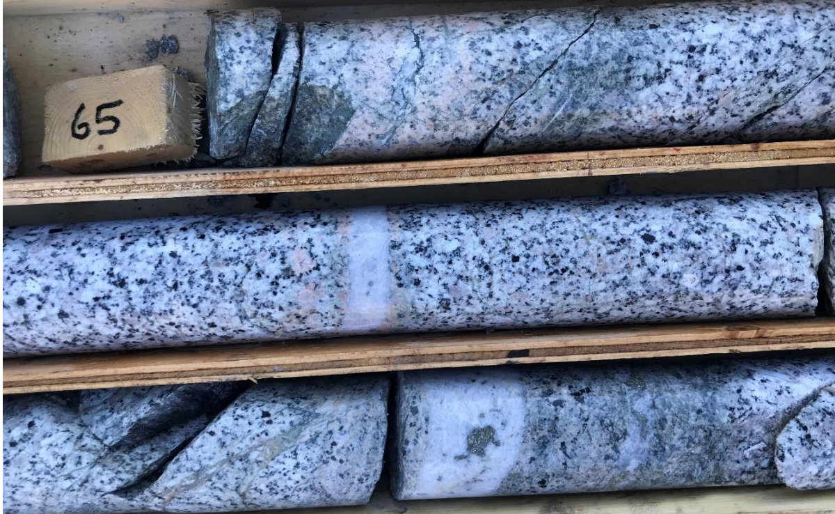
Figure 7. Strong propylitic alteration consisting of chlorite, chalcopyrite, pyrite, potassic feldspar and quartz from 65-67 metres at hole NET21-01.