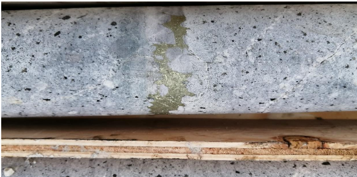
Figure 8. Massive chalcopyrite quartz vein at 193 metres at hole NET21-01.