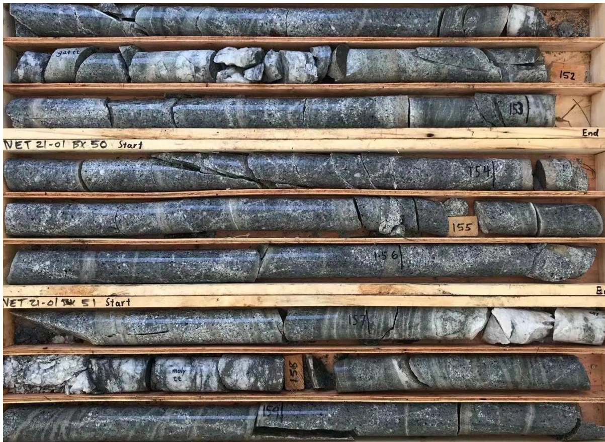
Figure 4. Intense sulfide-quartz veining with tetrahedrite, sphalerite, galena, chalcocopyrite, pyrite and molybdenite from 150.9 to 158.1 metres below surface.