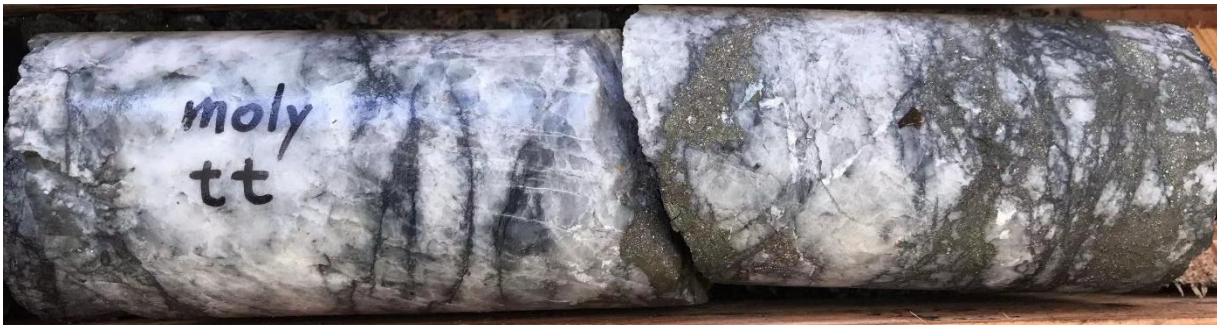
Figure 6. Core at 157.9 metres from NET21-01 shows high-grade Mo-Ag-Cu. A portable XRF analyzer reported molybdenum grades of up to 0.78%.