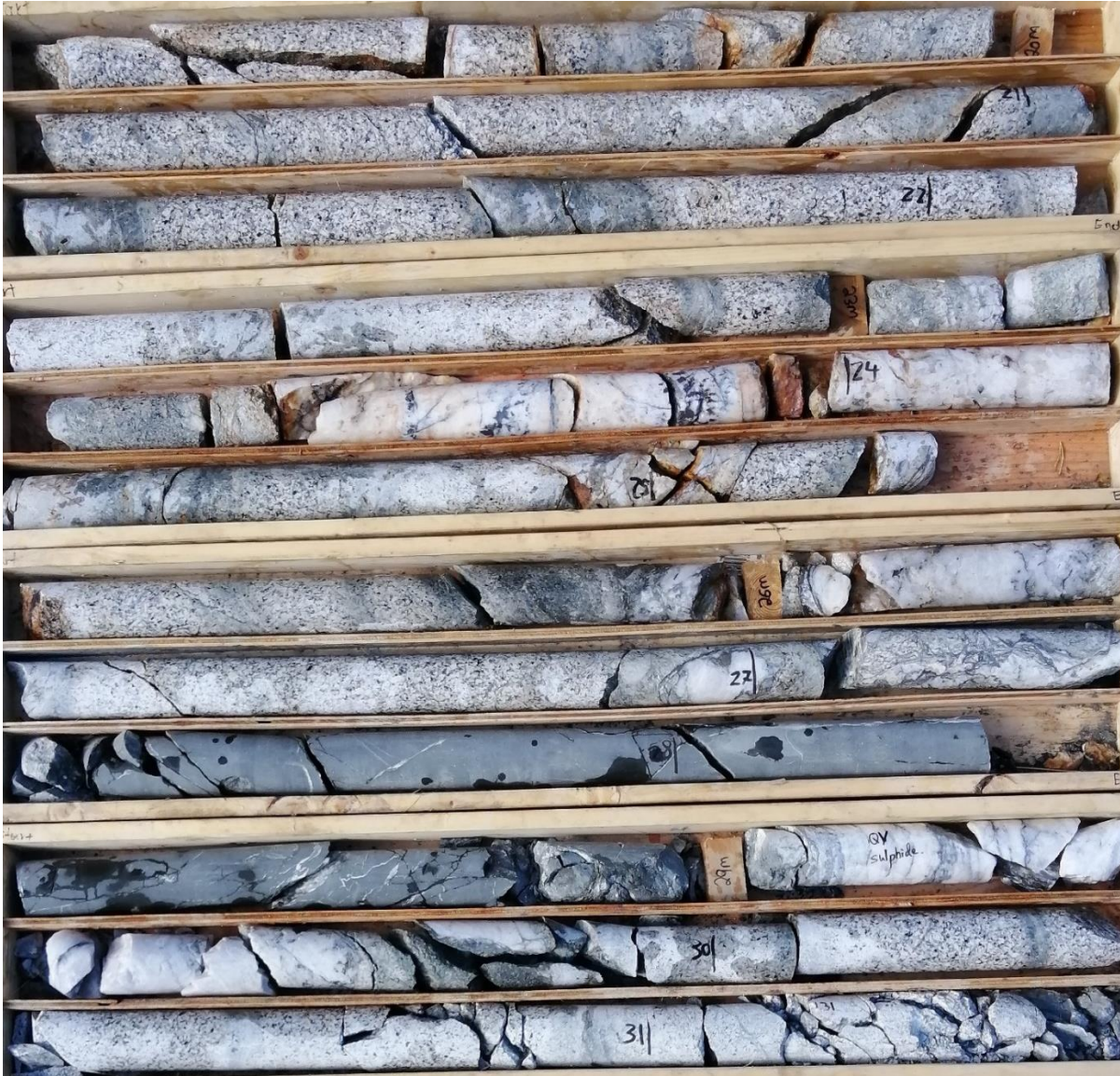
Figure 2. Intense sulfide-quartz veining with tetrahedrite, sphalerite, galena, chalcopyrite, pyrite and molybdenite from 21.0 to 31.1 metres below surface.