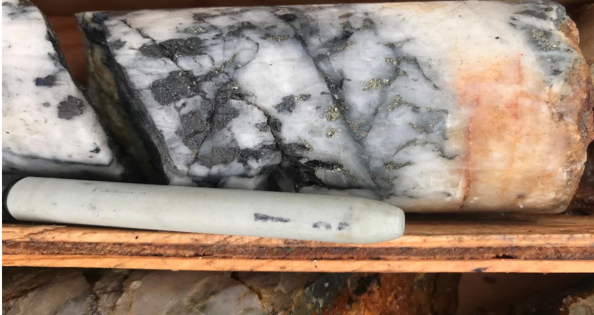
Figure 3. Core at 23.9 metres from NET21-01 shows high-grade Ag-Cu-Sb-Pb-Zn. A portable XRF analyzer reported Ag grades of up to 20,000 g/t from the tetrahedrite mineral.