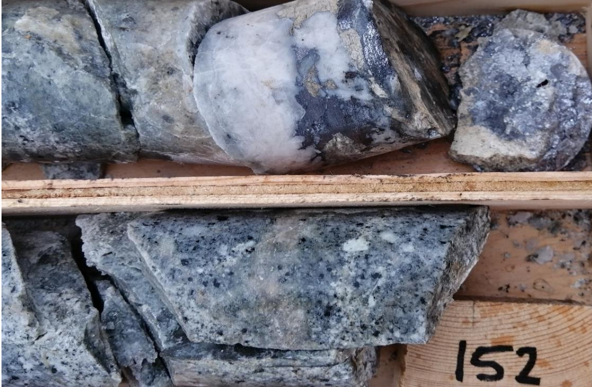
Figure 5. Core at 151.9 metres from NET21-01 shows high-grade Pb-Ag-Cu. A portable XRF analyzer reported lead grades of up to 49.9% from the galena vein.